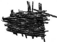
Hemp fabric excavated from the Torihama shell mound site (Mikata-cho, Fukui Prefecture)